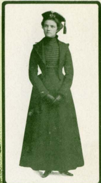
L. F. I. WINTER UNIFORM AND CAP.

Whatsoever things are true, whatsoever things are honorable, whatsoever things are just, whatsoever things are pure, whatsoever things are lovely, whatsoever things are of good report; if there be any virtue, and if there be any praise, think on these things Phil. IV: 8.