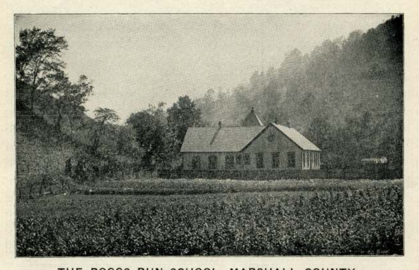
THE BOGGS RUN SCHOOL, MARSHALL COUNTY. A good example of a small Consolidated School with a minimum of expense for transportation. One wagon is used here.

dren are no longer compelled to leave their homes and go to the city in order to receive a liberal education. For along with the graded school a First Class high school was established. The children of this rural community may now pass from the senior class of the Sherrard school to the freshman class of any standard college or university. Essentially the same thing is true at every other point where consolidation has been effected. There are now seventeen school wagons in the state: six at Sherrard, and one at Boggs Run, Marshall county; four at Gary, McDowell county; two in Preston county; two in Taylor county; one in Wood county; and one in Hardy county. Not a single one of these wagons is run over anything better than the ordinary dirt road.