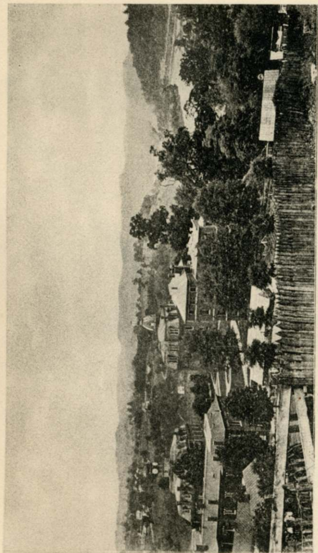
WEST VIRGINIA UNIVERSITY.