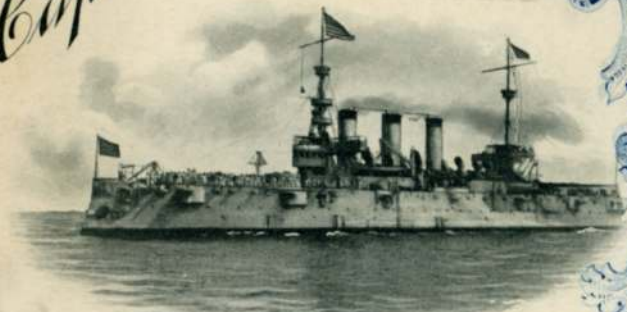
U.S. FLAGSHIP "NEW YORK"