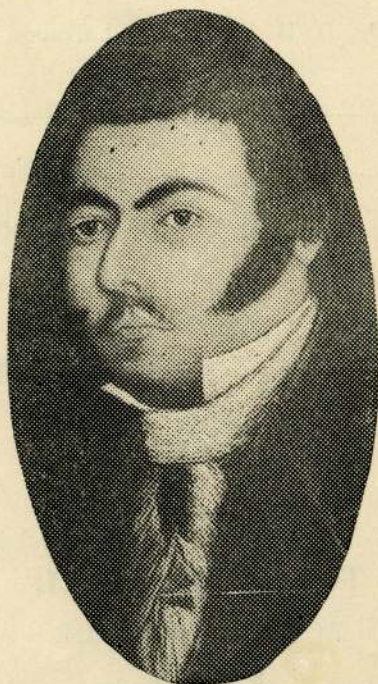
COL. ZACKQUILL MORGAN, Founder of Morgans Town, 1785

October 20, 21, 22, 23, 1926, Morgantown, West Virginia